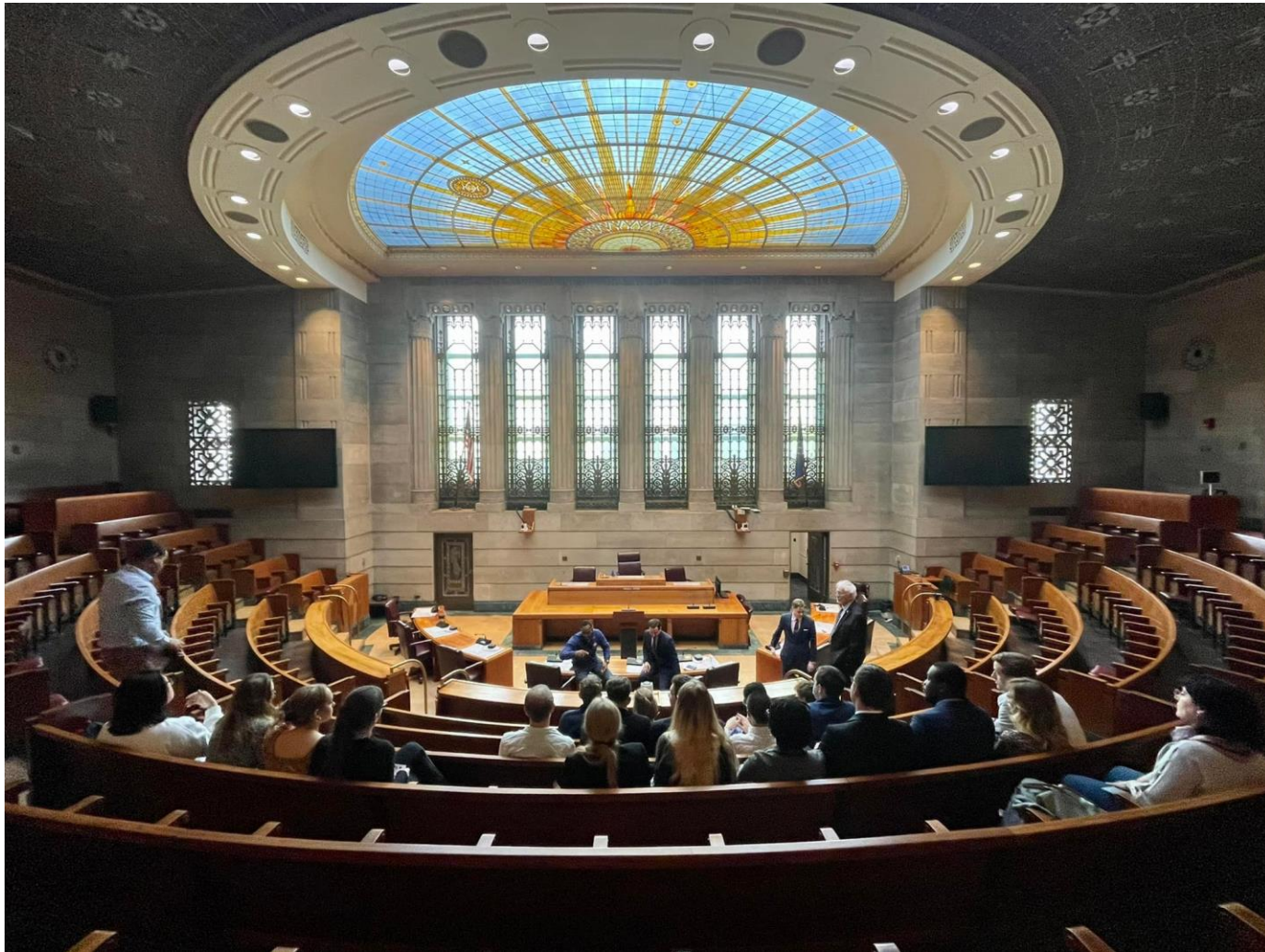
Students being briefed by City of Buffalo Common Council President, Chris Scanlon (now acting mayor)